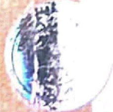
Chairman Rajasthan Public Service Commission, Ajmer